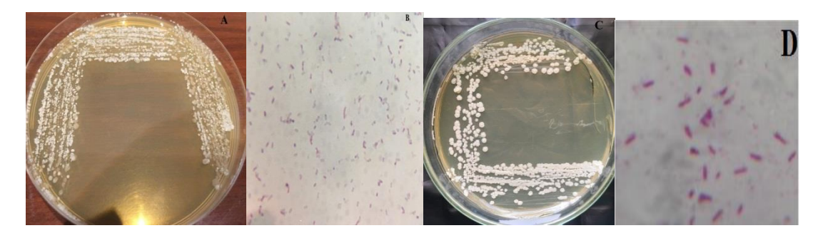
Fig. (1). Showing (A) Bacillus polymyxa culture cells (B) Bacillus polymyxa under light microscope with magnification power of X100 (C) Azotobacter chroococcum culture cells (D) Azotobacter chroococcum under light microscope with magnification power of X100.